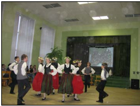
Dancers from Kandava Dance school present Latvian folk dances

When you are in Kandava, you will feel the real Latvian old town's air. It has medieval wooden houses, the oldest stone bridge in Latvia, Abava and the beautiful landscapes on their banks.