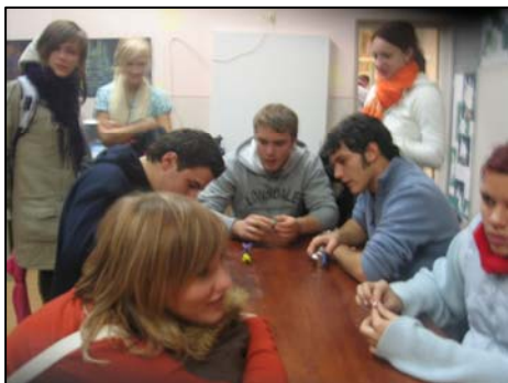
Workshop in Kandava Art school – plastic sculptures ‘To swim or to sink...’